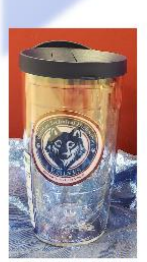
The 16 oz. sells for only $20.

Whether you have been longing for a great travel cup for your hot beverages during these "cold" days or a way to show your school spirit while staying hydrated, these custom Sheridan Tech tumblers fit the bill. Made by Tervis (a Florida company), each double-wall insulated tumbler is dishwasher safe and comes with a lifetime warranty.