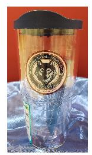
The 24 oz is $22